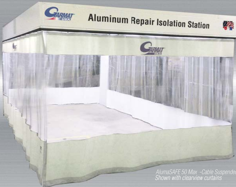
AlumaSAFE 50 Max - Cable Suspended Shown with clearview curtains